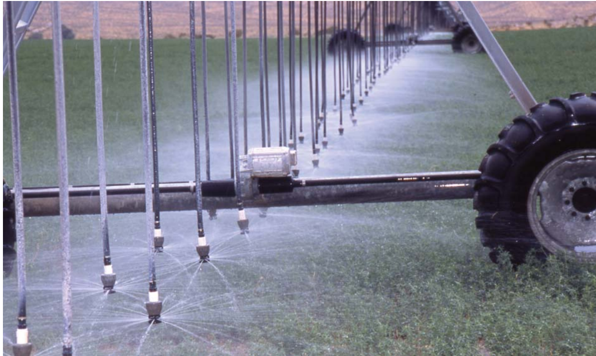
A low-energy, precision watering device irrigates an alfalfa field in Newberry Springs, Calif., part of a SARE grant project teaching farmers how to use soil moisture sensors to conserve water.

Published by the Sustainable Agriculture Network (SAN), the national outreach arm of the Sustainable Agriculture Research and Education (SARE) program, with funding from the Cooperative State Research, Education and Extension Service, USDA.